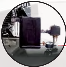
Mounted Motor Starter (model CE8003 only)