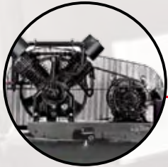
Totally Enclosed Metal Belt Guard