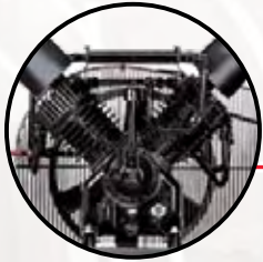
Cast Iron Two Stage Pump