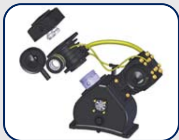
Flow-Tek™ Concentric Disc Valves for Maximum Performance & Longevity