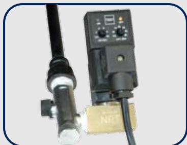
Auto Tank Drain eliminates daily maintenance