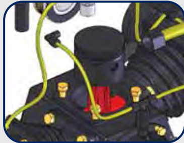
Ram-Tek: Solid Steel, heavy gauge rods for maximum Performance & Durability