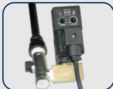
Auto Tank Drain eliminates daily maintenance