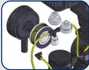
Flow-Tek™: Concentric Disc Valves for maximum Performance & Longevity