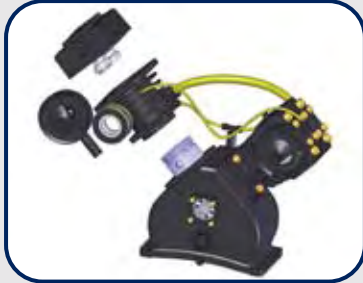
100% Cast Iron Construction