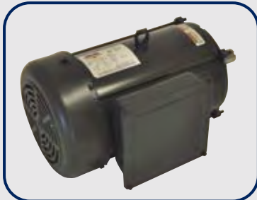
Large Industrial Lincoln Motors, 1750 RPM with High Starting and Running Torque