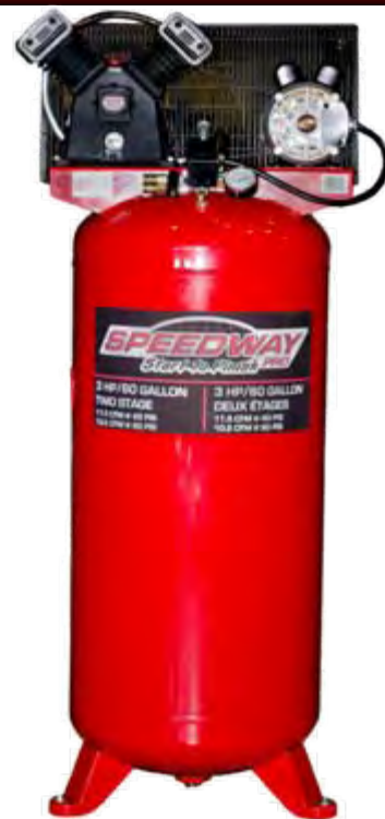
51850 60 Gal (1stage)