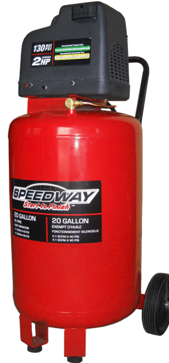
52401 20 Gallon Air Compressor

Steel thickness: .105" Tank Cert: Non ASME Certifications: CSA/UL Certified Motor Size/Amp/HP: 2HP 15A Motor type : Induction Cord Length: 6.25ft. Cord Type: 15AWGx3C UL rated Regulator Spec: Diaphragm Quick Connect coupler details : Dual "Push Connect" coupler manifold Shroud type : V rated plastic full enclosure