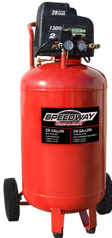
52619 28 Gallon Air Compressor

Steel thickness: .105" Tank Cert: Non ASME Certifications: CSA/UL Certified Motor Size/Amp/HP: 2HP 15A Motor type : Induction Cord Length: 6.25ft. Cord Type: 15AWGx3C UL rated Regulator Spec: Diaphragm Quick Connect coupler details : Dual "Push Connect" coupler manifold Shroud type : V rated plastic full enclosure