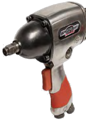
3/8" Air Ratchet