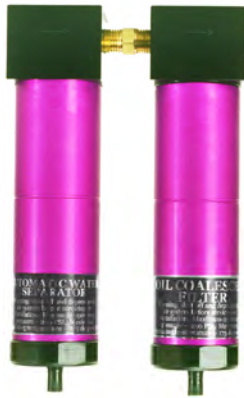
P/N 21999-0424 Tsunami™ 2-stage Filter System (separator and oil coalescing filter)