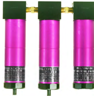
P/N 21999-0421 Tsunami™ 3-stage Filter System (separator / oil coalescing / activated carbon)