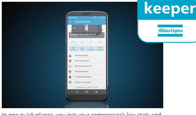
In one quick glance, you get your compressor's key stats and weekly usage report.