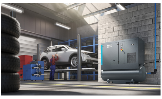
AIRkeeper is available for Atlas Copco's G 7-15 and G 15L-22 compressor ranges.