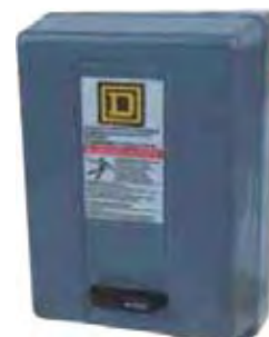
Single and Three Phase Magnetic Starters