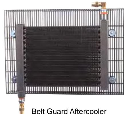
Belt Guard Aftercooler