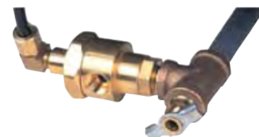
Automatic Tank Drains