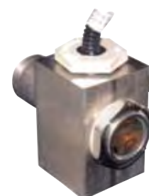
Low Oil Level Switches