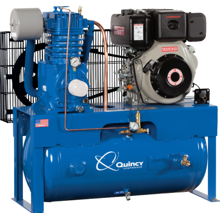
QP-7.5 with Yanmar Engine