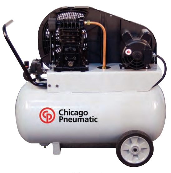
RCP-3561V RCP-226VP RCP-220P