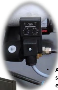
Auto Drain system - eliminates the need for daily maintenance