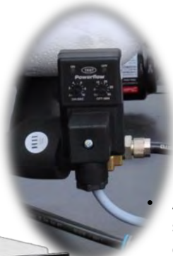
• Auto Drain system - eliminates the need for daily maintenance