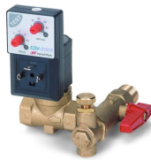
Electronic Drain Valves