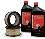
Small Reciprocating Start-Up Kits