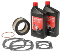
Small Reciprocating Maintenance Kits