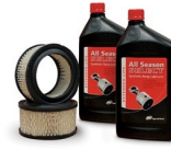
Small Reciprocating Start-Up Kits