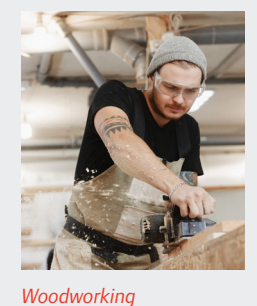
Sawing, clamping, hoisting, actuation & controls, pressure treatment

Powering impact guns, ratchets, grinders, drills, nailers, paint sprayers, sanders and more