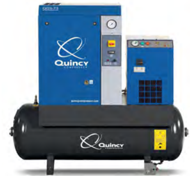
Quincy QGS 7.5 shown with integrated dryer