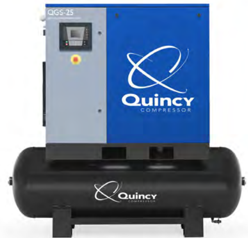
Quincy QGS 25 tank mounted