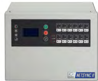
Optional Net$ync II