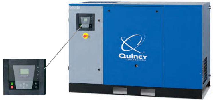
Quincy QGS 30 shown with integrated dryer