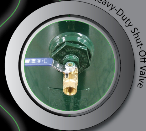
Heavy-Duty Shut-Off Valve