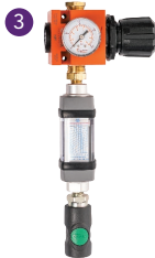
3 CFM TEST KIT CFM Test Kit measures air flow rate: • 3 CFM to 30 CFM • 1 CFM to 10 CFM - available by special order