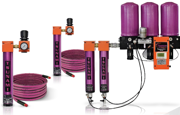
DOUBLE BOOTH AND PREP