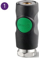
1 HIGH FLOW COUPLERS