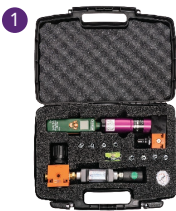
1 TSUNAMI AIR PREP KIT