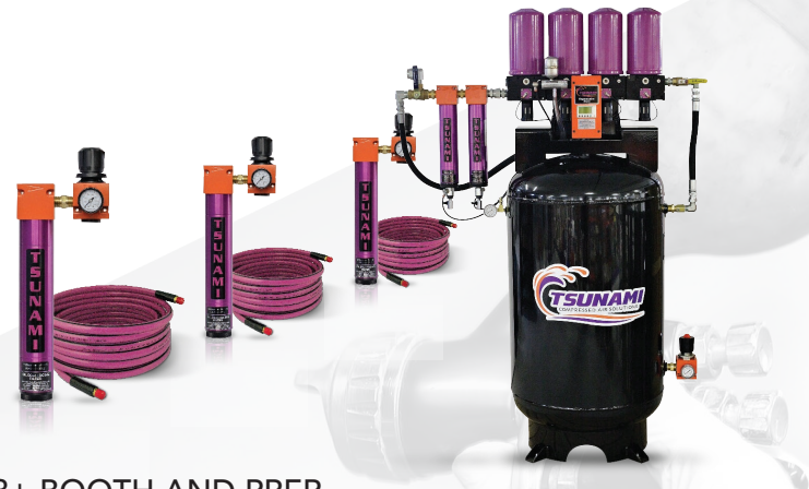
3+ BOOTH AND PREP