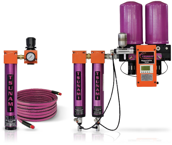
SINGLE BOOTH AND PREP