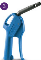
3 BLOW GUNS